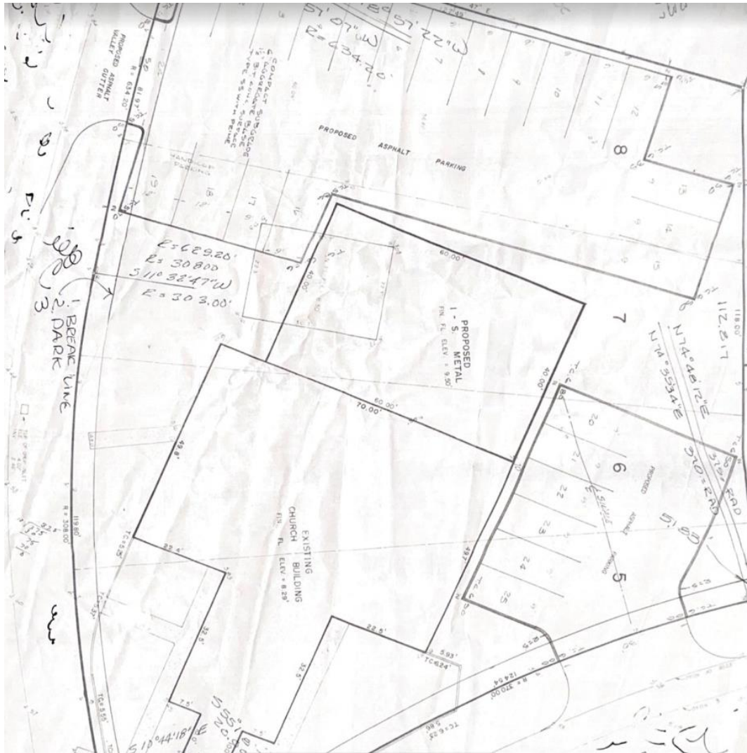
1980s survey of Ocean Park Baptist shows 25 parking spaces

In the attached documents, you will see our vision for the future of the church, historic photographs, maps, surveys and examples of other historic chapels that have also been converted into event spaces.