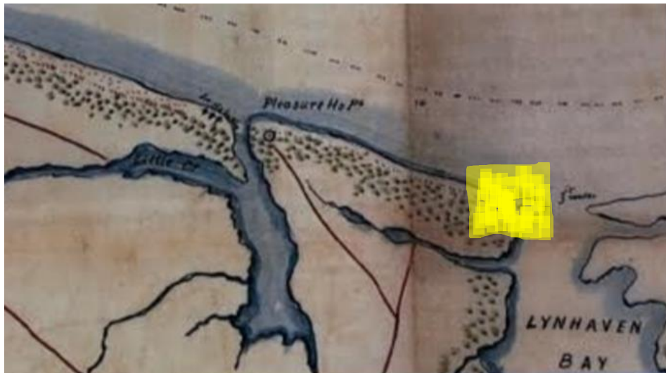
Union reconnaissance map 1862. Note the existence of three cannons at the mouth of the Lynnhaven Inlet near modern day Ocean Park.