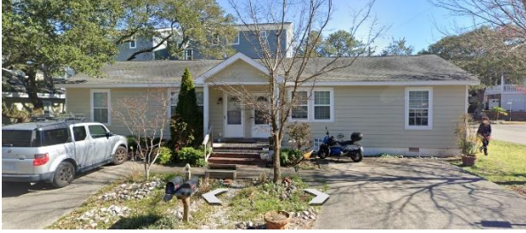
3617 Dupont Circle. 1950 vernacular.