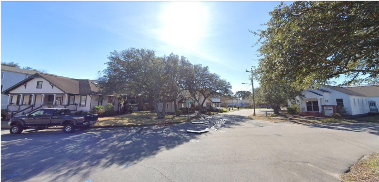
Above :Google street view looking West towards Ocean Park Baptist