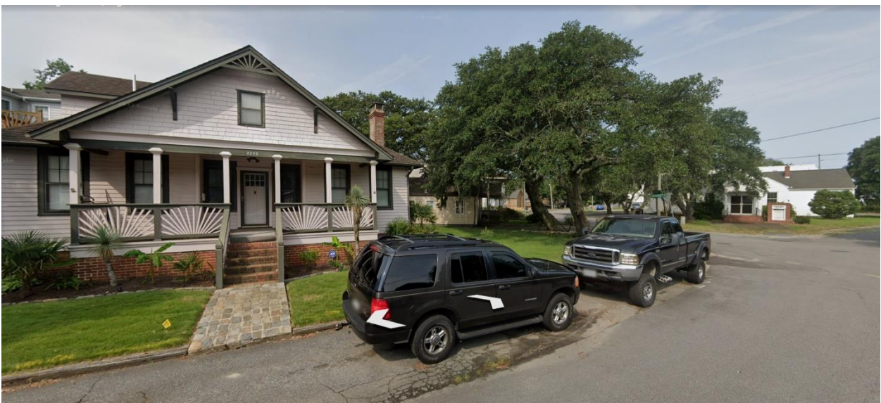
Below: Google street view looking North towards Ocean Park Baptist