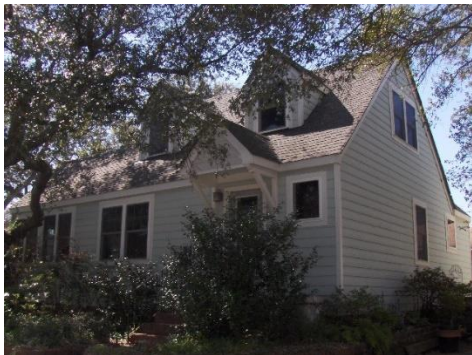
3612 Dupont Circle. 1950 vernacular.