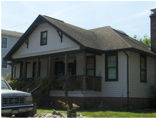
2209 Dinwiddie. 1934 Craftsman.