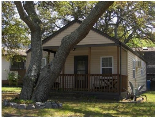
3625 Dupont Circle. 1950 vernacular.