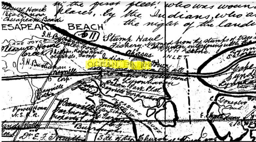
Sam's map. 1930

The history of the Ocean Park area dates back to pre-Colonial America with documentation of a native American Village named ASPASUS in the vicinity. Ocean Park was part of Adam Throughgoods original 1634 land grant, was the location of a civil war battery and was the home of a hotel, casino and Boardwalk in the 1920s. Almost all the original structures in Ocean Park built before 1950 have been demolished. The Ocean Park Church and the houses surrounding the intersection where it is located are remaining remnants of this historical neighborhood.