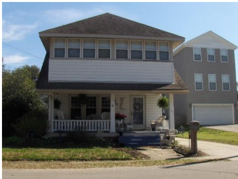
3629 Dupont Circle. 1942 Craftsman.